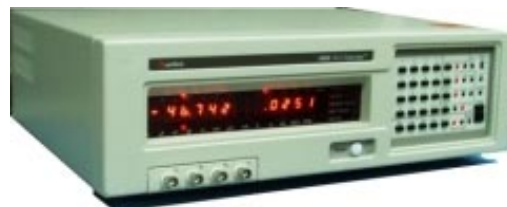
Figure 2: QuadTech 1689 and 1693 Digibridge Instruments

For complete product specifications on the 1600 Series Digibridge Line or any of QuadTech's products, visit us at http://www.quadtech.com/products . Do you have an application specific testing need? Call us at 1-800-253-1230 or email applications at jkramer@quadtech.com and we'll work with you on a custom solution. Put QuadTech to the test because we're committed to solving your testing requirements.